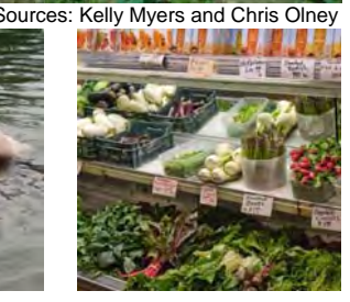
Harm to our ecosystem, recreation, drinking water and food safety are some of the many negative impacts caused by DEP's pollution of the Lower Esopus.