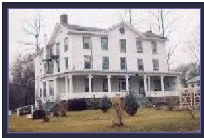
8 – Family Rental in Kingston – Non-Subsidized