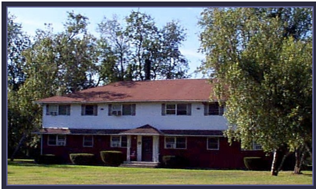
Hudson Valley Apartments in Shawangunk – Non-Subsidized

There are also 114 units that have been included in the category entitled "other." This category includes units with more than three bedrooms or units of varying size that have additional living space such as a den.