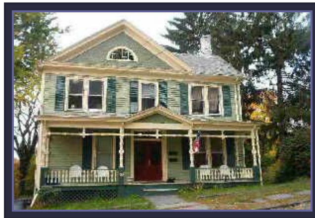
Two Family Rental in Kingston – Non-Subsidized