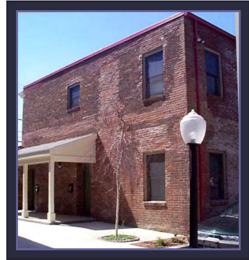
Hasbrouck Apartments in Kingston - Subsidized